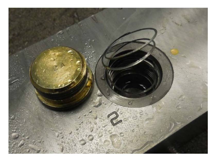
Figure 4 - Failure Mode: Typical ZLGP Ejection