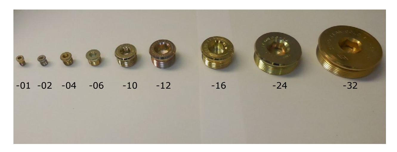
Figure 5 – ZLGP: Before Test Top Overview