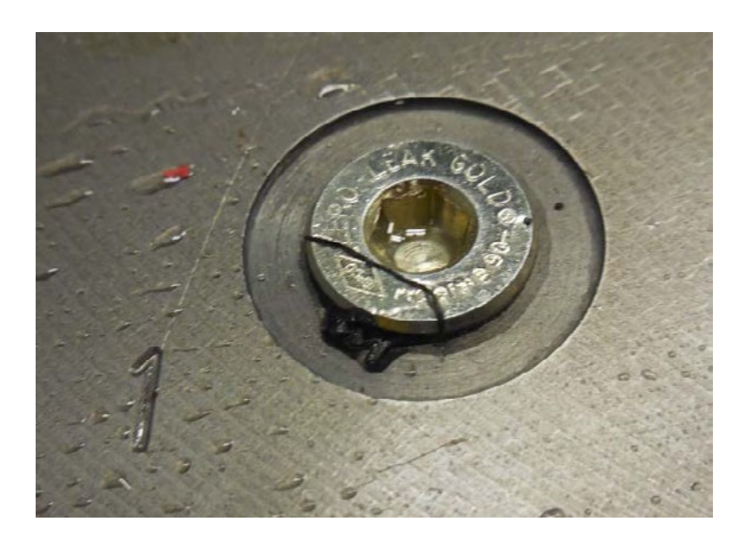
Figure 3 – Failure Mode: Typical ZLGP Extrusion

A "ZLGP Extrusion" failure was determined by the loss of the metal to metal (ZLGP contact with manifold) seal due to the water pressure either lengthening the ZLGP and/or the change in angle. The inspected result was the ZLGP seal opened enough which allowed the 70 Durometer Buna O-ring to pass through the gap as shown in Figure 3.