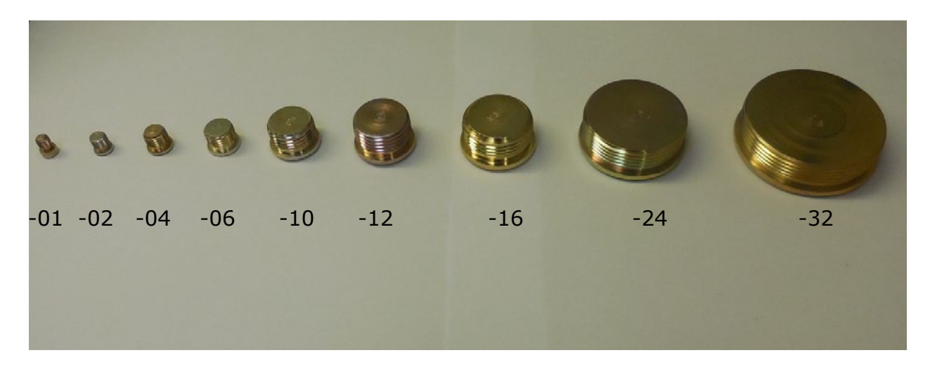
Figure 6 – ZLGP: Before Test Bottom Overview