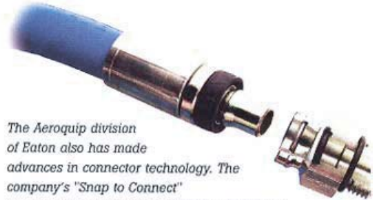
The Aeroquip division of Eaton also has made advances in connector technology. The company's "Snap to Connect" connector technology is designed to eliminate leakage. The threadless connector is designed as an alternative to threaded-type fitting commonly used in fluid power systems with working pressures up to 6,000 psi.