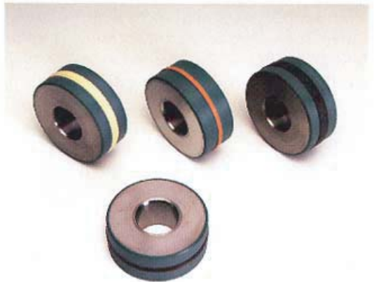
Improved elastomeric seal technology has helped ensure machine reliability and provide better leak prevention. Parker Hannifin's integrated piston, from its Seal Group, combines piston, bearing and seal in a self-contained package. The design helps reduce side load effects in aerial lifts, excavators and other equipment where safety and prolonged service are critical.

the system's potential leak points," says Schrage.