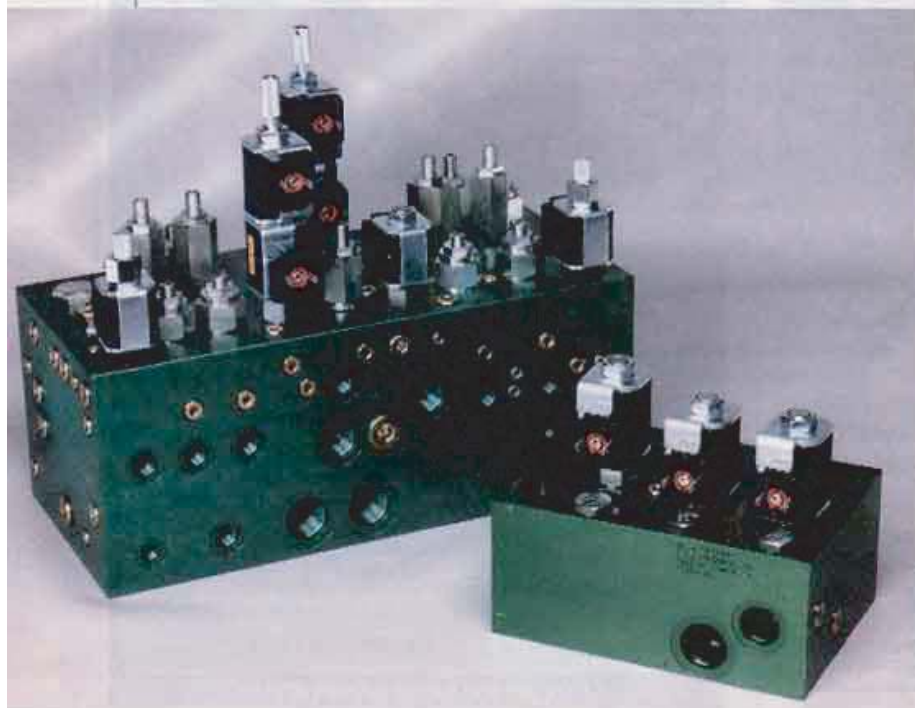
Fig. 1. Free-standing drilled-block manifolds accept numerous valves.

Because the internal passages can be cut in contoured shapes and as large as necessary, nearly any flow rate can be accommodated with virtually no pressure drop. Because the stack is brazed together, these manifolds can handle pressures to 10,000 psi, and there is no limit to the number or size of the valves