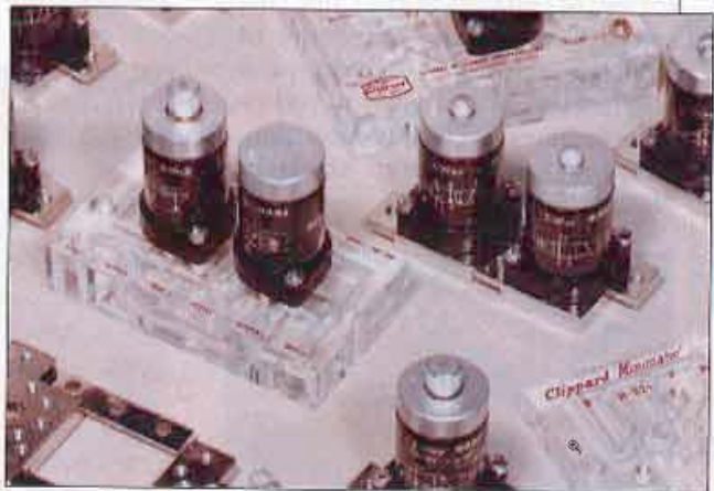
Fig. 4. Low pressures in pneumatic systems allow manifolds to be made from easily shaped materials such as clear acrylic.